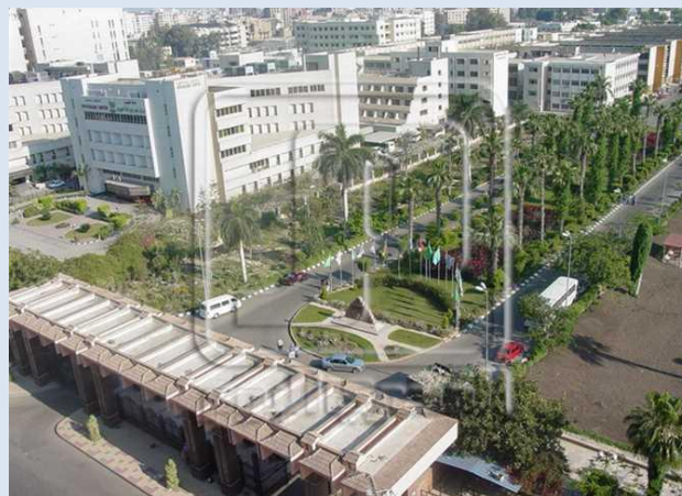
Mansoura University Campus

The registration fees in cash money or as a Bank Draft to the National Bank of Egypt, Account No.: 9/450/87891/9 should be forwarded to: Micro-analytical Unit, Chemistry Department, Faculty of Science, Mansoura University. If the payment is being made by an institution, the participant's name should be indicated.